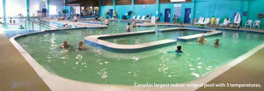
Canada's largest indoor mineral pool with 3 temperatures.