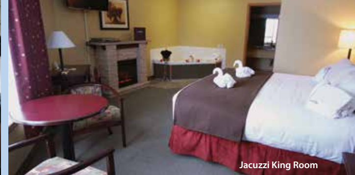
Jacuzzi King Room