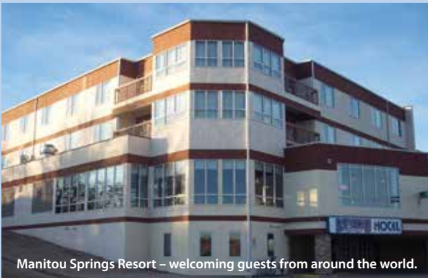
Manitou Springs Resort – welcoming guests from around the world.

We welcome tours, seniors, family celebrations, conventions and special requests. Gift cards and hotel reservations available online.